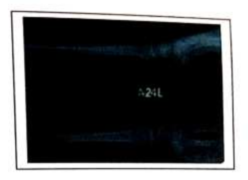
X-ray 21st day